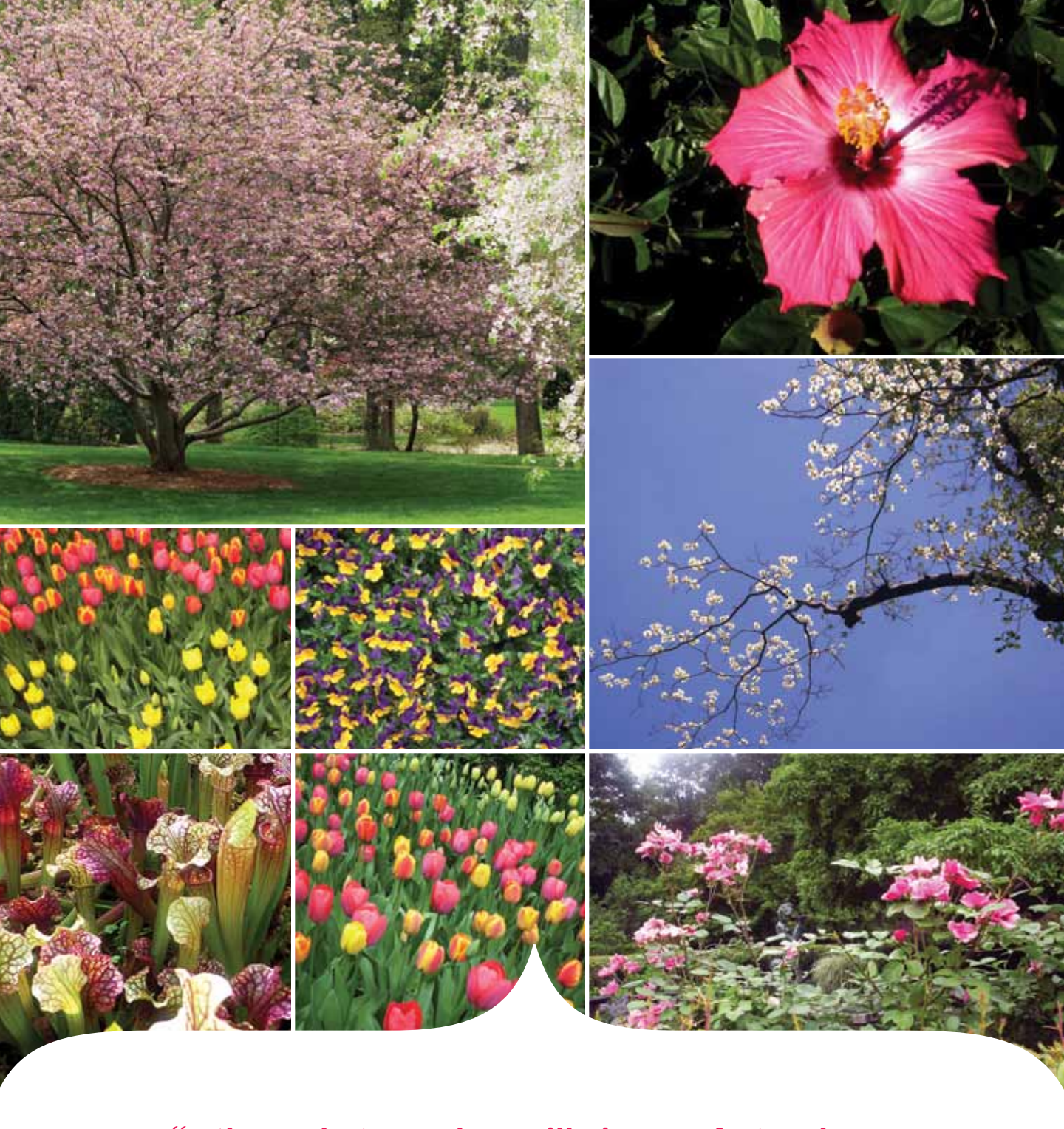
"...these photographs... will give comfort and hope to patients and their families, visitors, and caregivers."