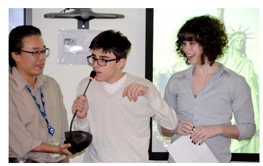
Among the topics covered were US Presidents, Bridges of New York, Applying for College, and France.

For the presentations, the groups picked a topic of interest to both parties and researched the information together.